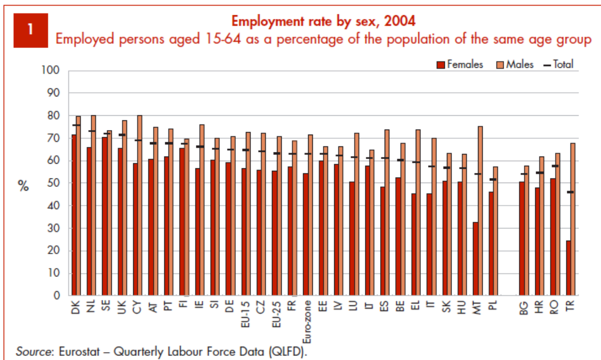
Figure 4: Employment rate by sex, 2004

As we can observe in the Figure 4, Portugal has one of the highest female activity rates in the European context, close of the Scandinavian countries and Netherlands. Relatively to the other Southern European welfare regime countries the contrast is evident both in the present and when we consider a longitudinal perspective. As reflect the Table 5, in Portugal the female activity rate remains at a higher level than Spain, Greece and Italy.